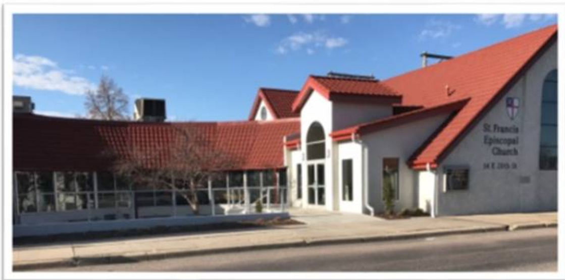
Expanded Narthex, Wall Removed, New Identification Signage

With the construction part of the project having been completed by early in 2019, the new letters mounted on all four sides of the church were added in 2019. During late 2019 and into 2020, we expanded our vision for completing this project by preparing to commission a custom cross to mount above the new entry and adding a large mosaic piece to the 20 th Street face of the church.